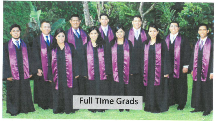
Full Time Grads