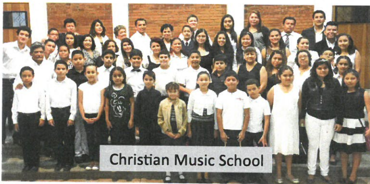
Christian Music School

our twenty-three graduates from the Full Time and Saturday Seminary Programs. We are thankful to the Lord for these students that have finished this part of their preparation for the Lord's work. Most of the graduates have been called by churches to serve as pastors, mission workers and Bible teachers.