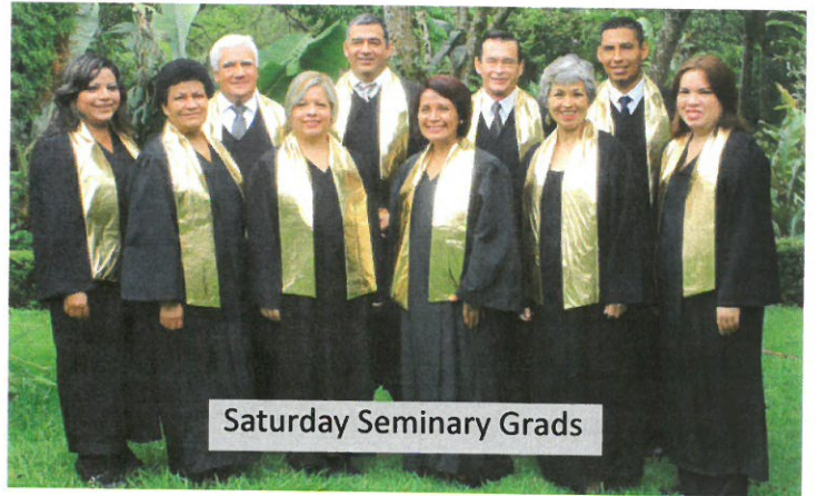
Saturday Seminary Grads