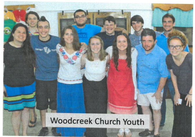
Woodcreek Church Youth

Language difference was no problem at the Chinanteco churches in the villages of Arroyo Limon and La Fuente Misteriosa. They were blessed by the hard work of the Woodcreek Church Youth group who went and held Bible Clubs for the children and also gave the church buildings in these two places a major facelift, painting them inside and out. God used these high school kids, led